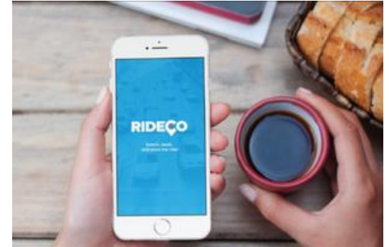
App-Based On-Demand Shared Ride Service