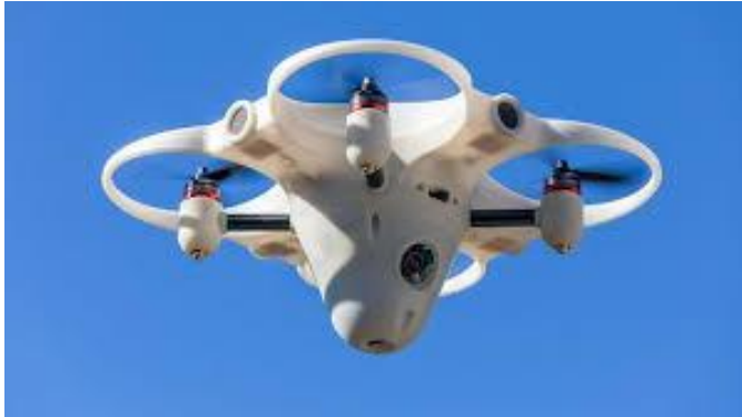
Drone Program for Security & Maintenance Inspections