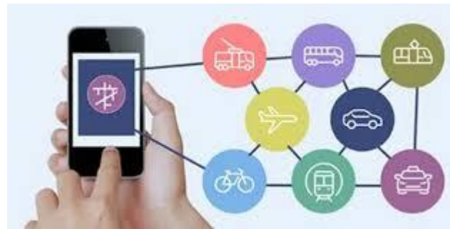
Connect Smart App