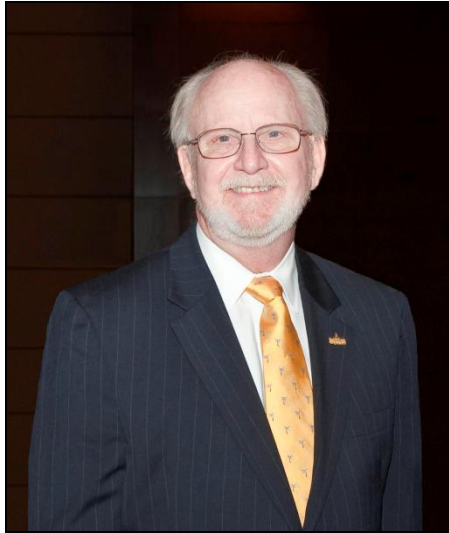
Commissioner Gary Fickes Tarrant County, Precinct 3