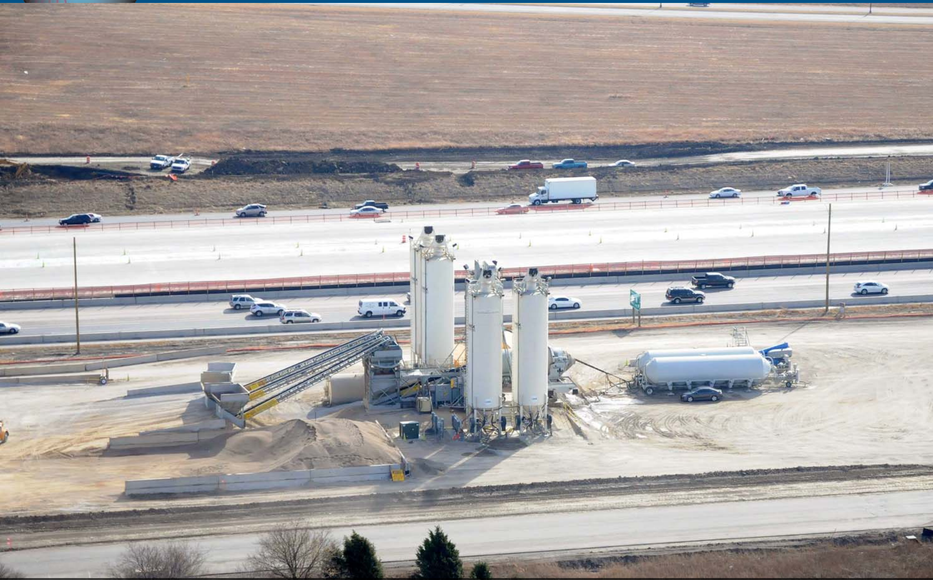
December 2010: Concrete batch plant north of SH 114/121