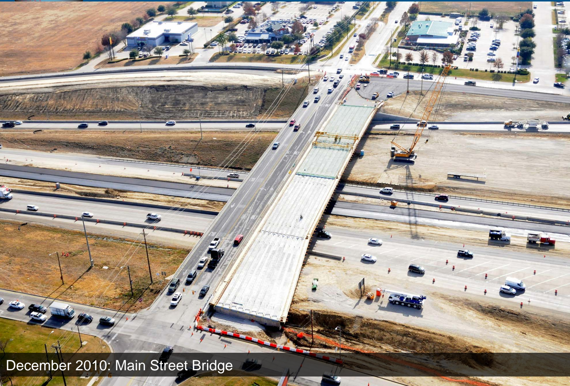
December 2010: Main Street Bridge