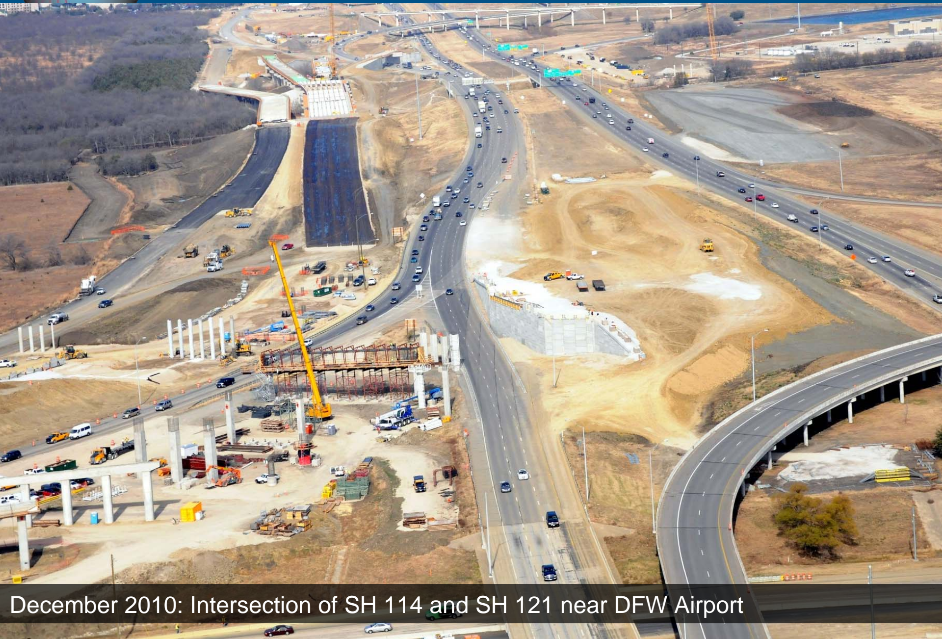
December 2010: Intersection of SH 114 and SH 121 near DFW Airport