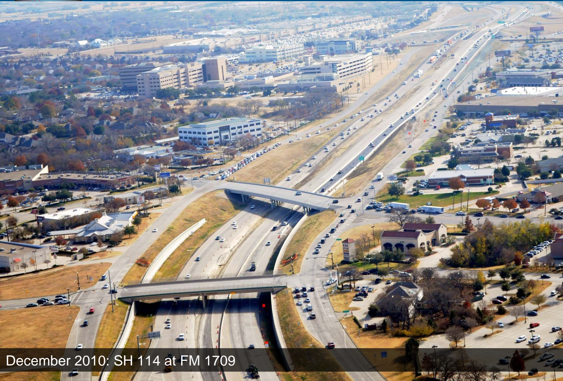
December 2010: SH 114 at FM 1709