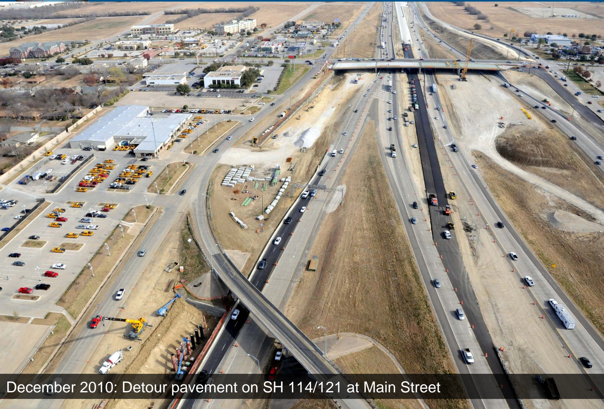
December 2010: Detour pavement on SH 114/121 at Main Street