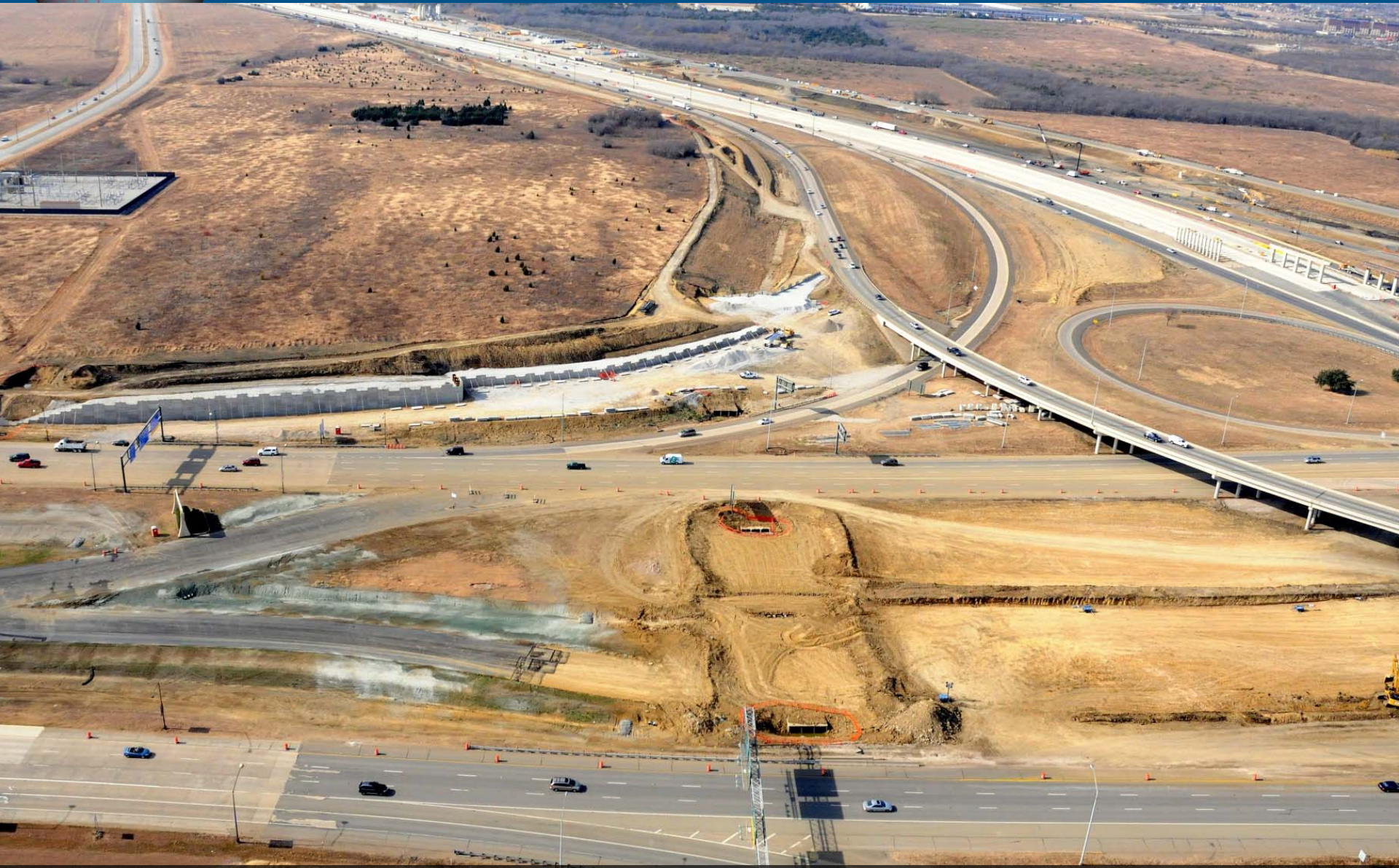
December 2010: Grading and wall work at DFW Airport's north entrance