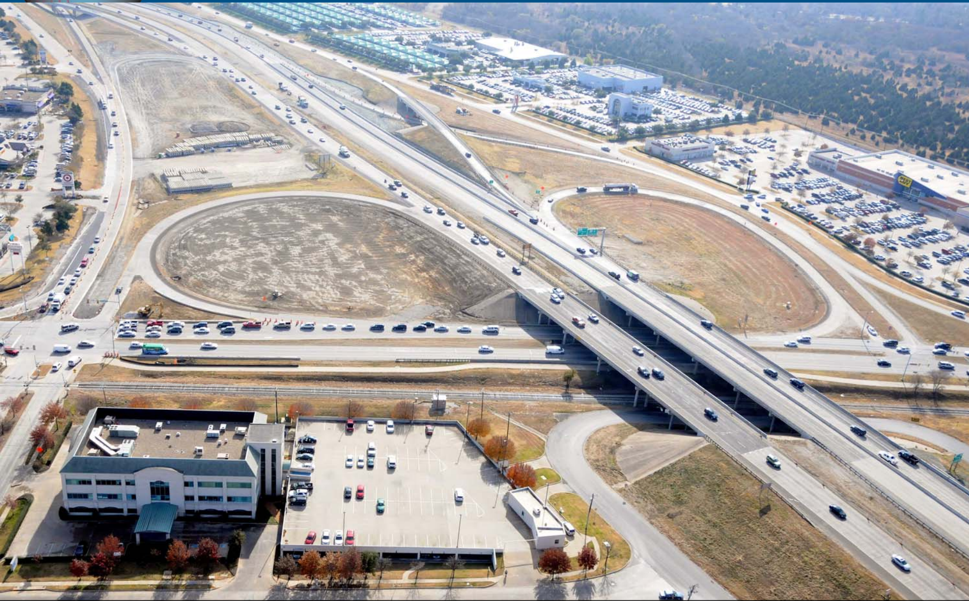
December 2010: SH 114 at SH 26