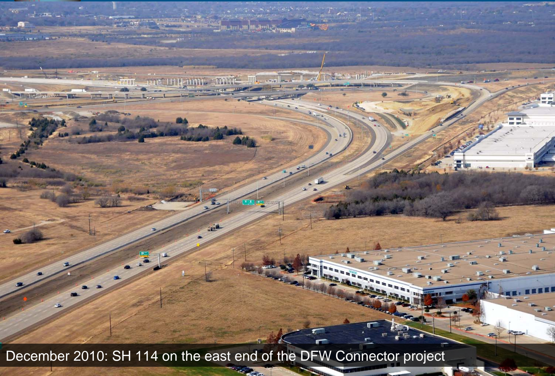
December 2010: SH 114 on the east end of the DFW Connector project