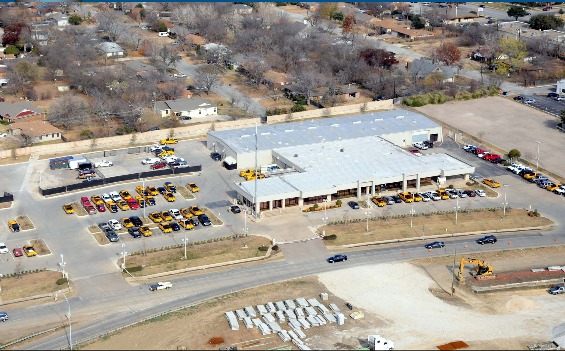
December 2010: Field office at SH 114 and Main Street