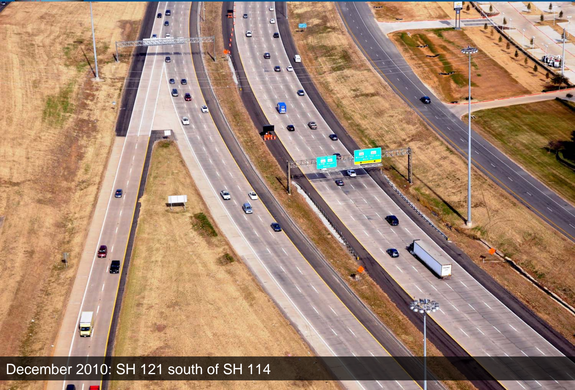
December 2010: SH 121 south of SH 114