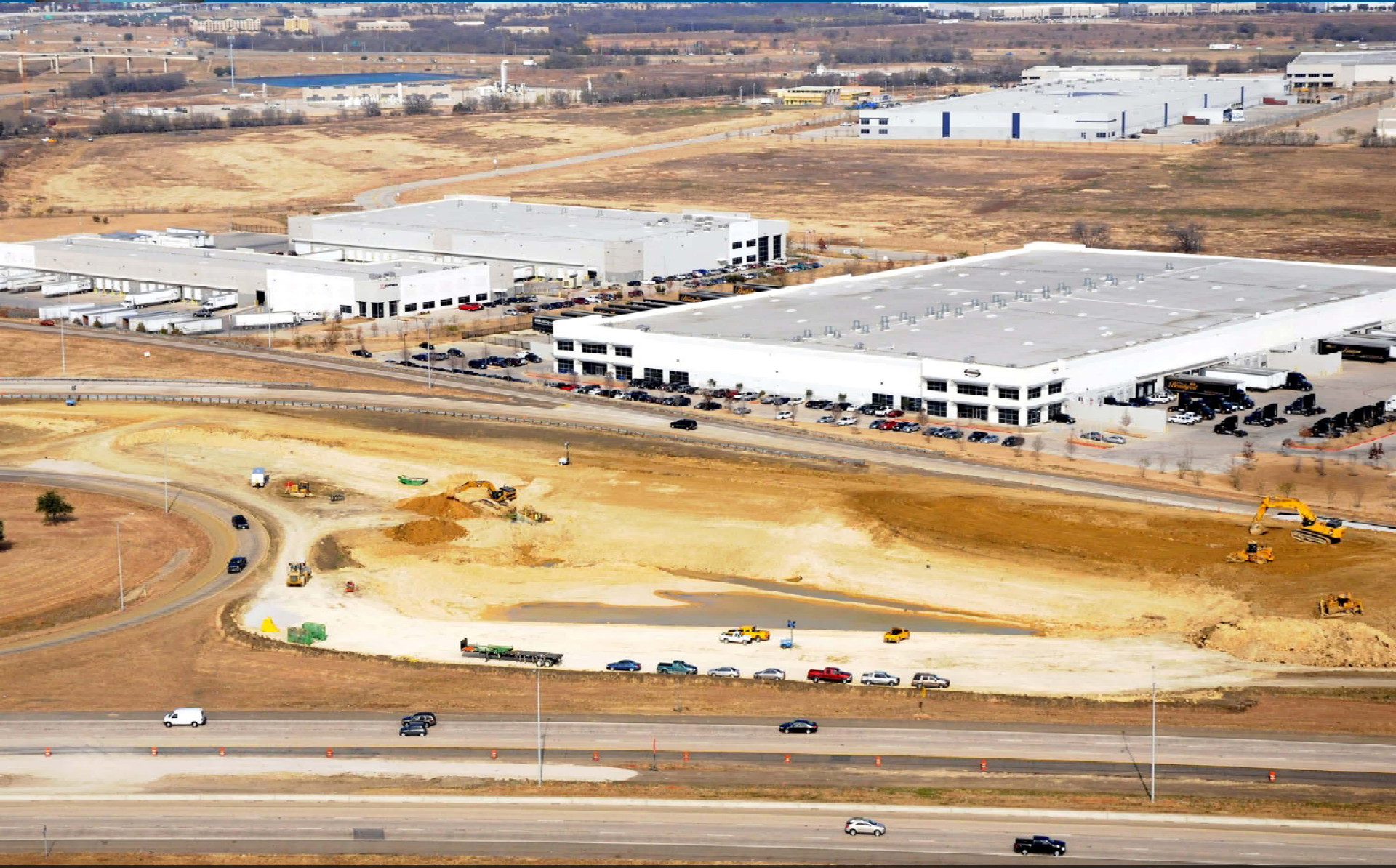
December 2010: Grading work east of DFW Airport