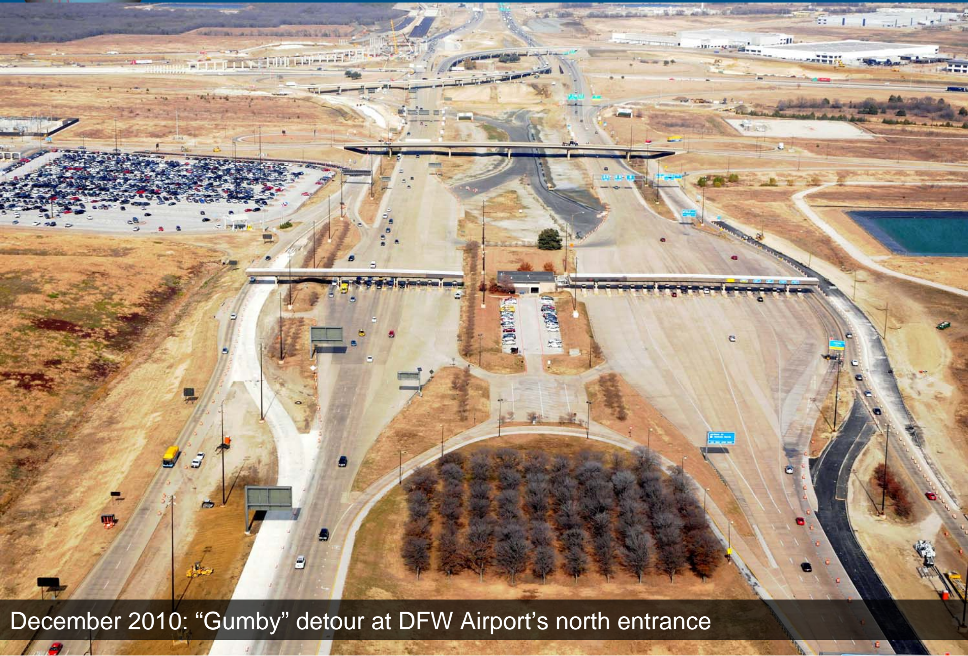
December 2010: "Gumby" detour at DFW Airport's north entrance