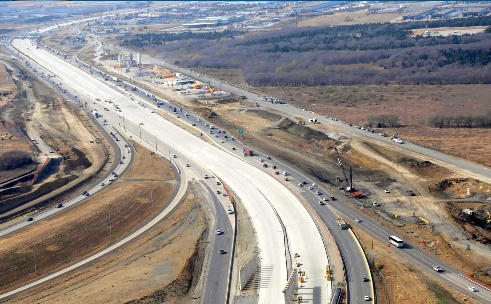
December 2010: New concrete paving in the SH 114/121 median