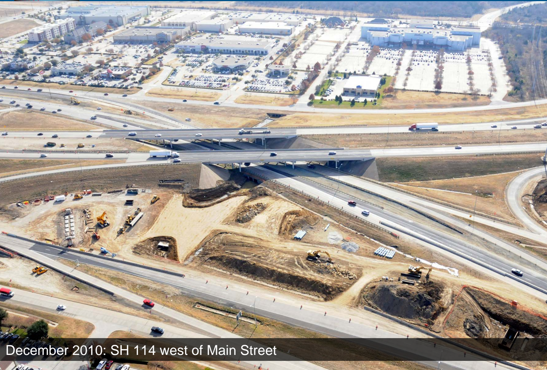
December 2010: SH 114 west of Main Street