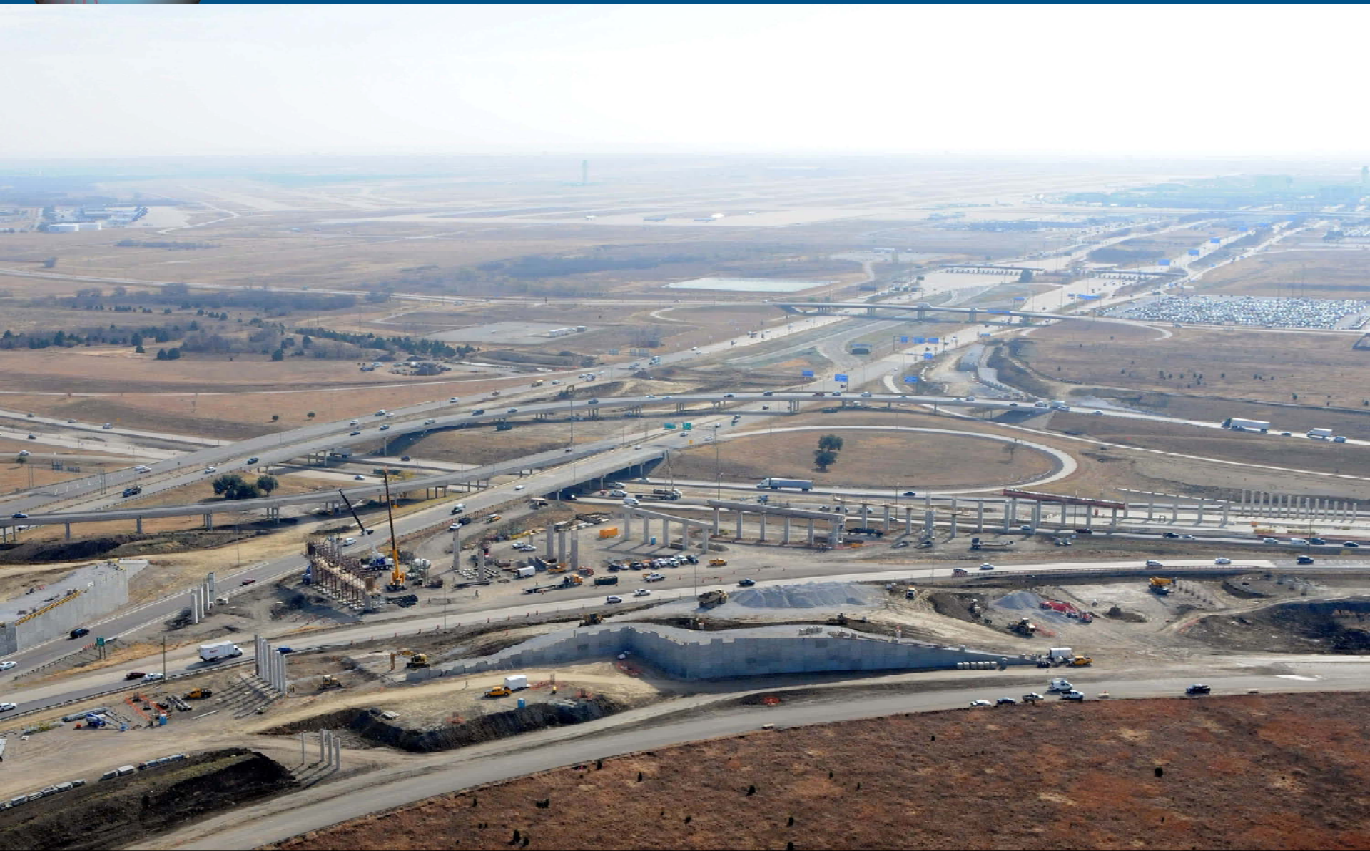
December 2010: Southbound SH 121 ramp to westbound SH 114