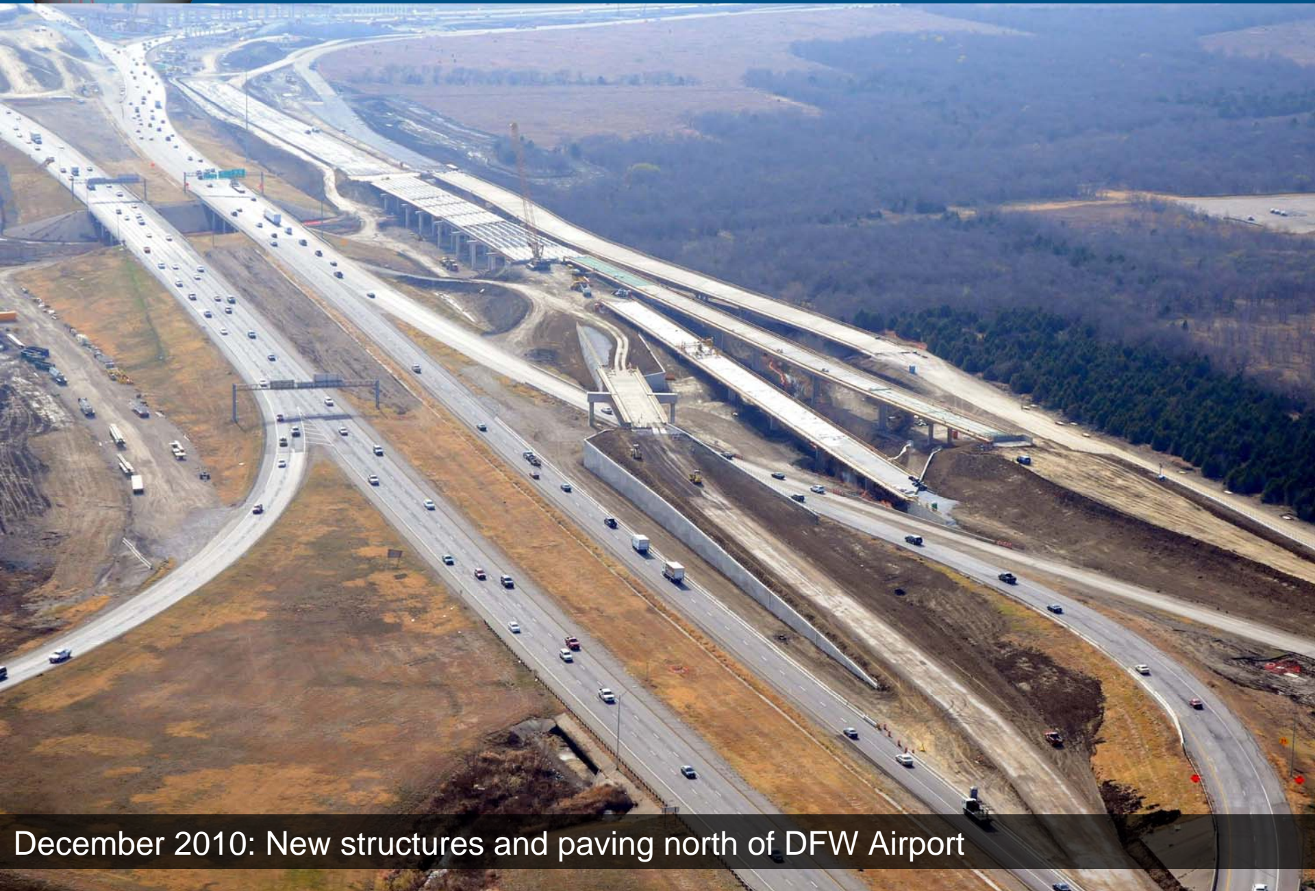
December 2010: New structures and paving north of DFW Airport