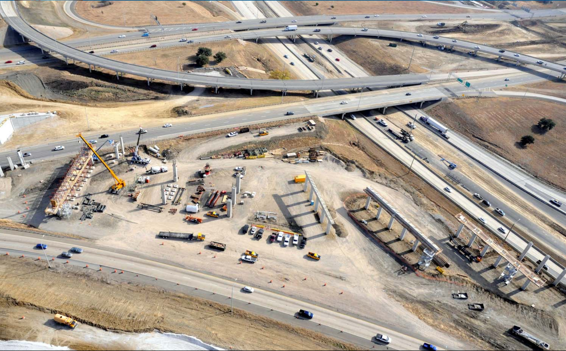
December 2010: New eastbound SH 114 to northbound SH 121 bridge