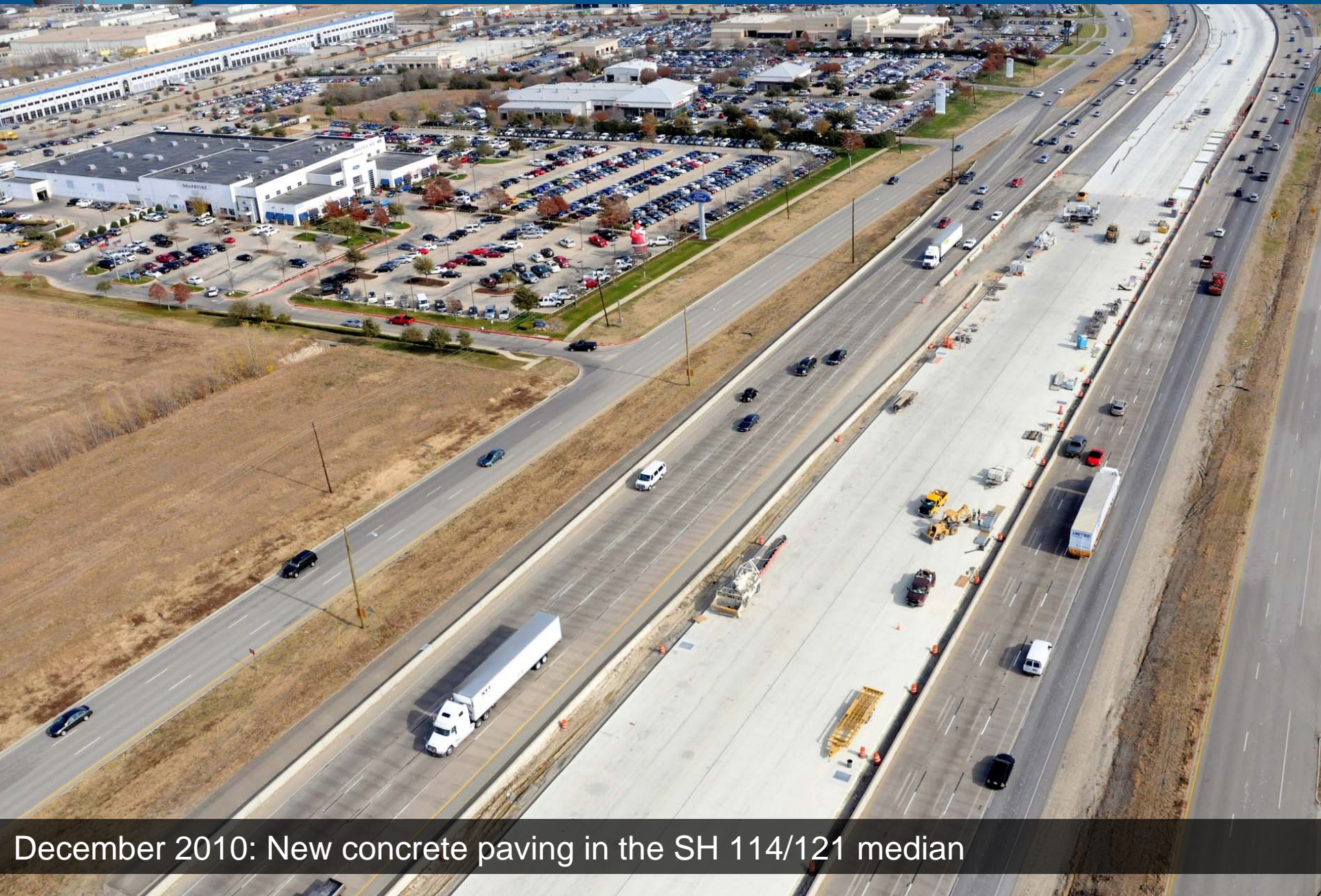
December 2010: New concrete paving in the SH 114/121 median