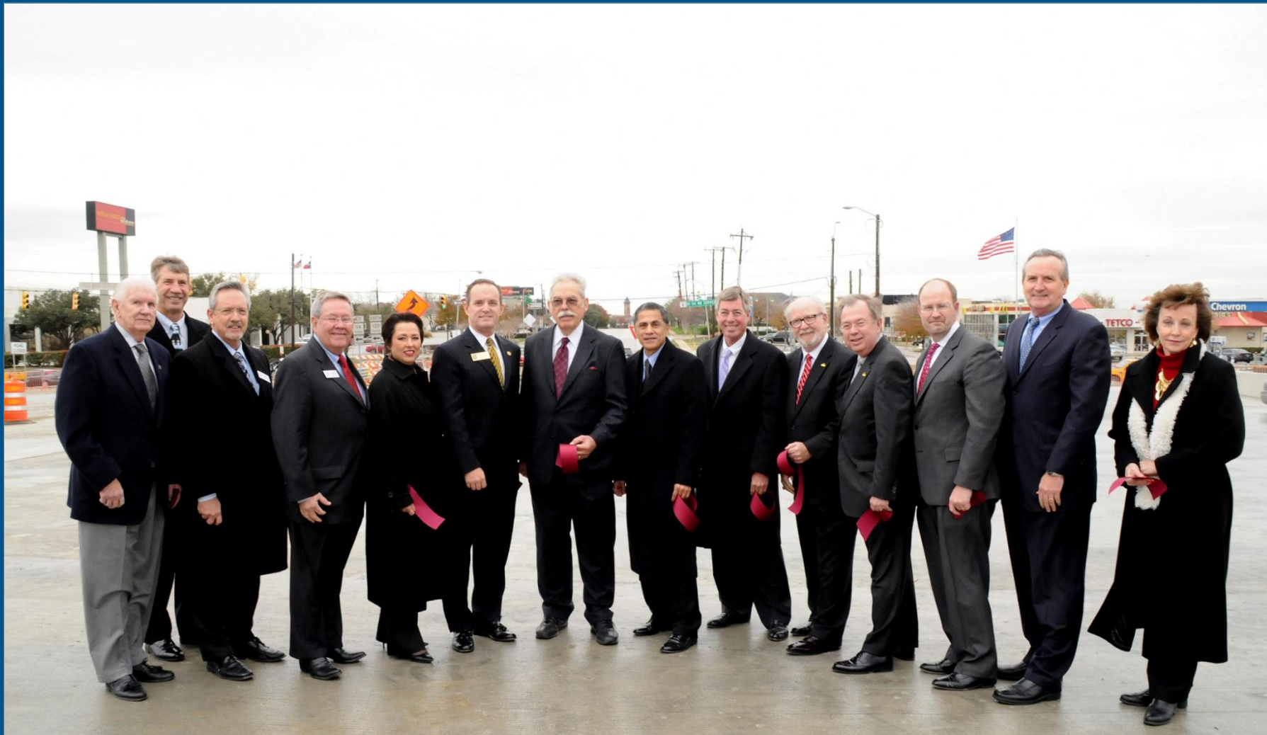
December 2011: DFW Connector Milestone Celebration