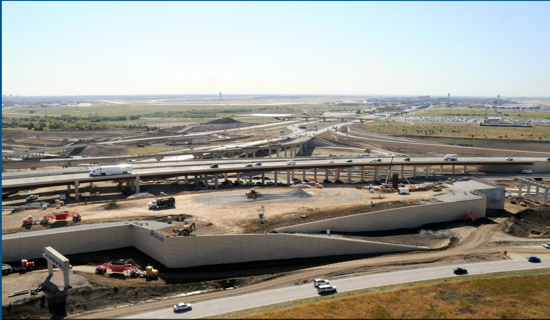
October 2011: Eastbound SH 114 to northbound SH 121 bridge