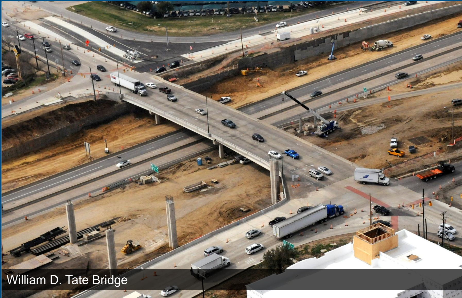
William D. Tate Bridge