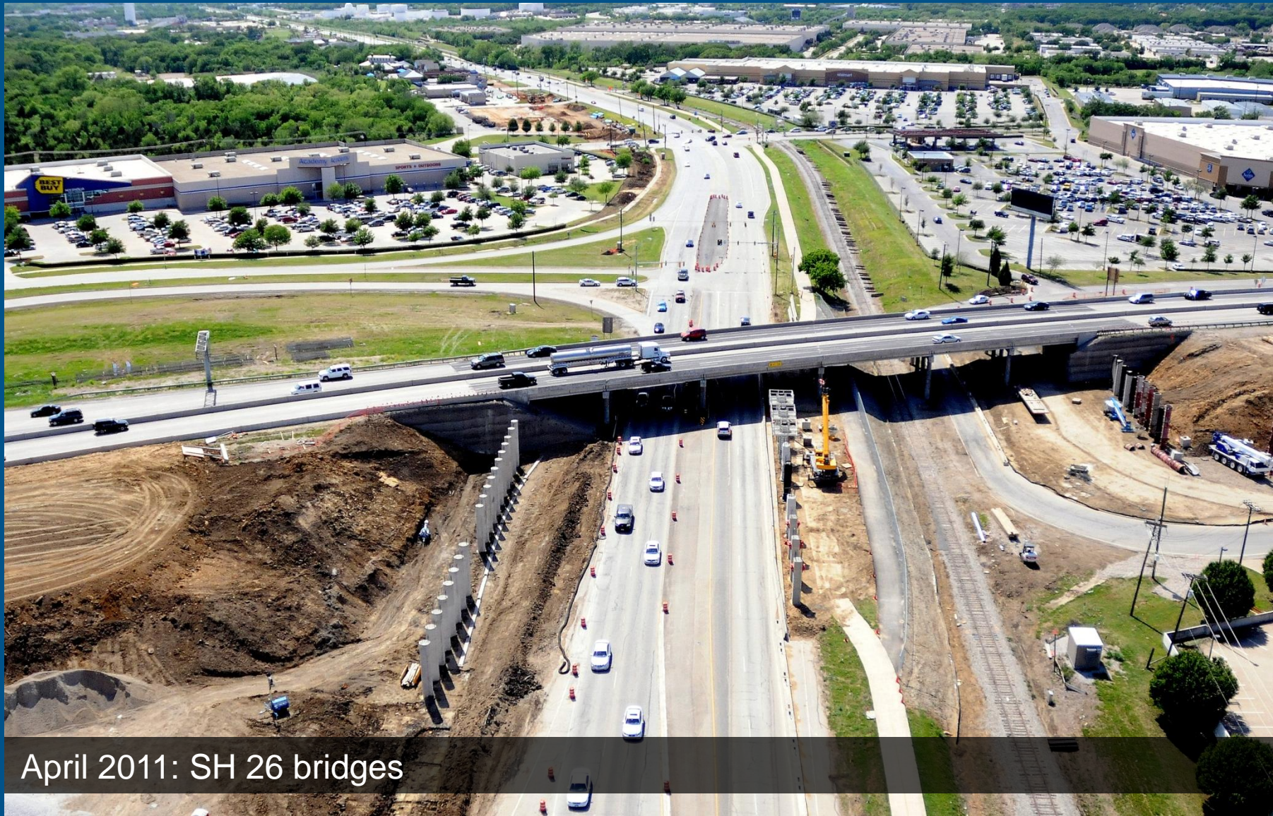
April 2011: SH 26 bridges