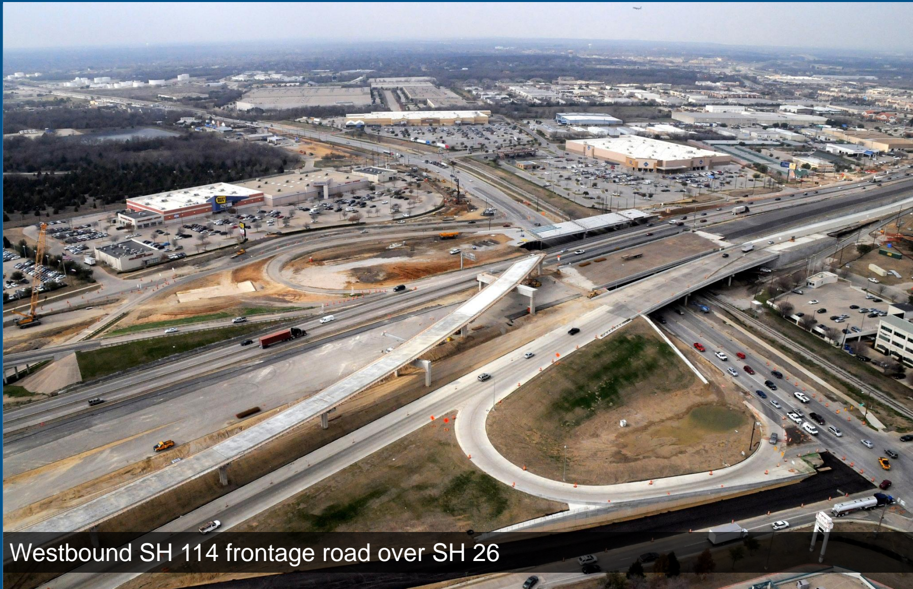
Westbound SH 114 frontage road over SH 26