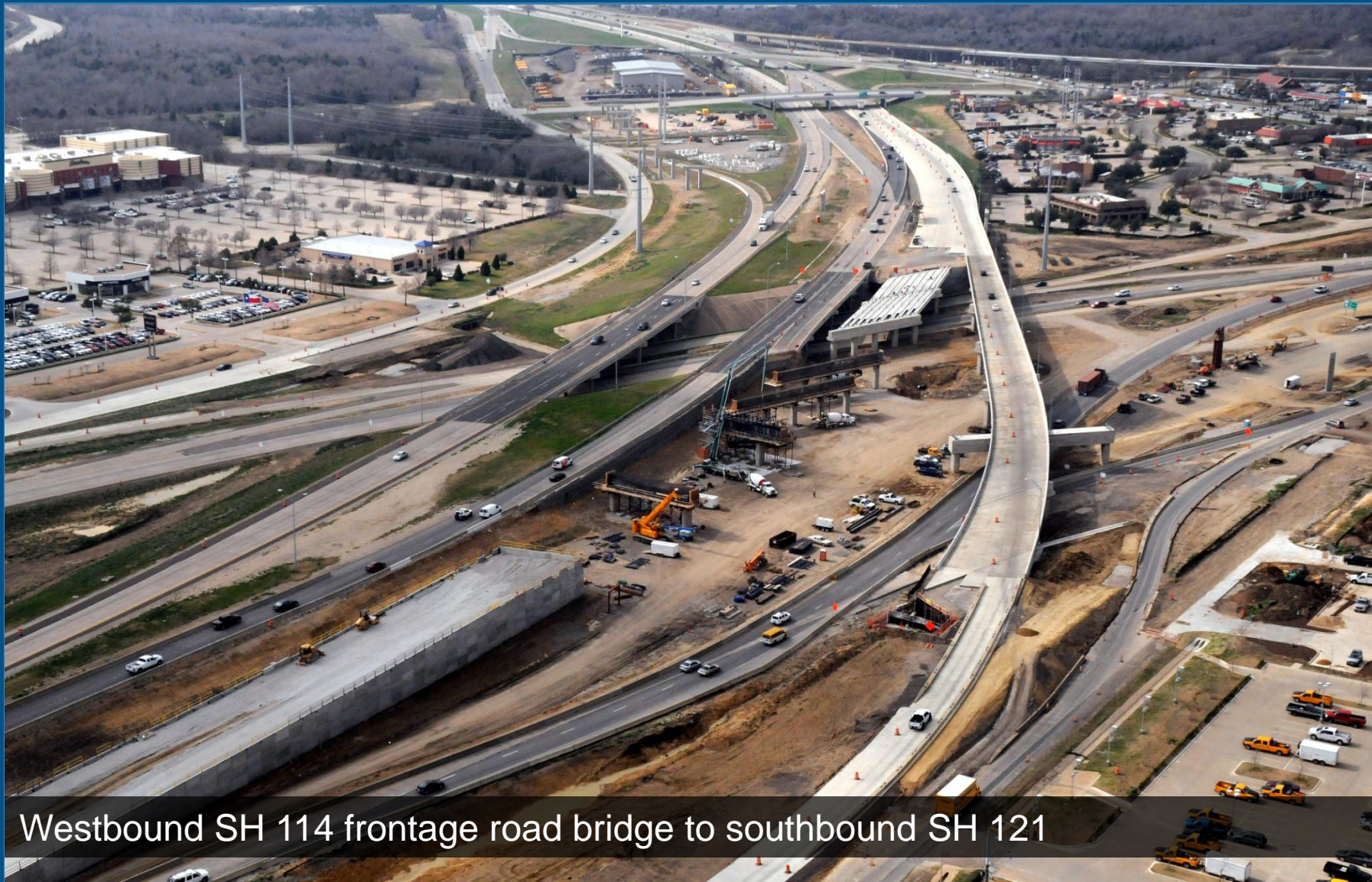
Westbound SH 114 frontage road bridge to southbound SH 121