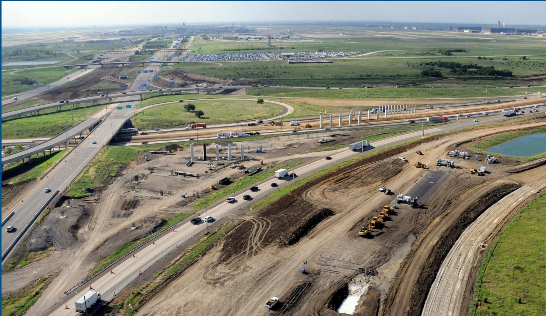
September 2010: Eastbound SH 114 to northbound SH 121 bridge