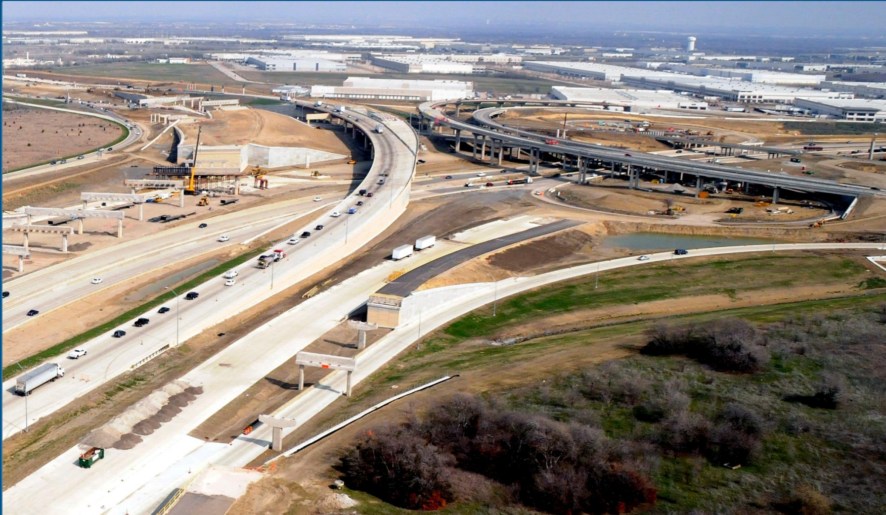
Eastbound SH 114 off-ramp to DFW Airport