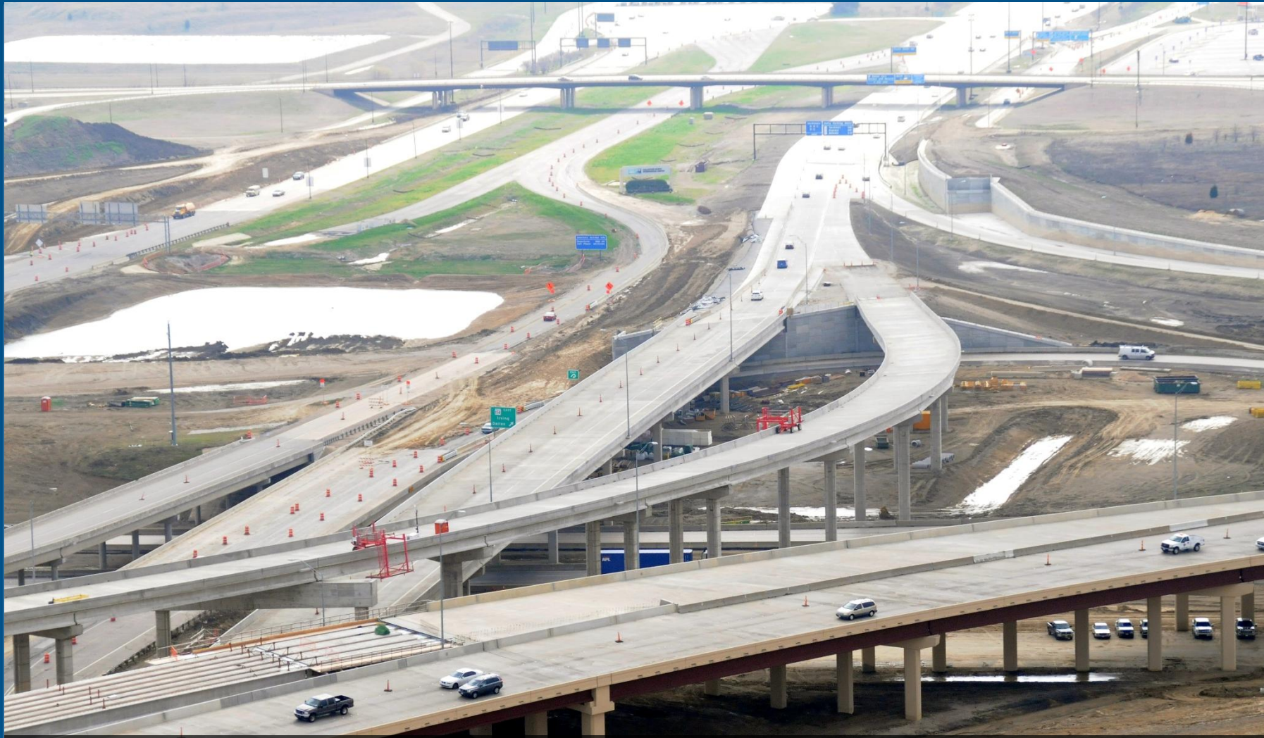
Southbound International Parkway bridge over SH 114