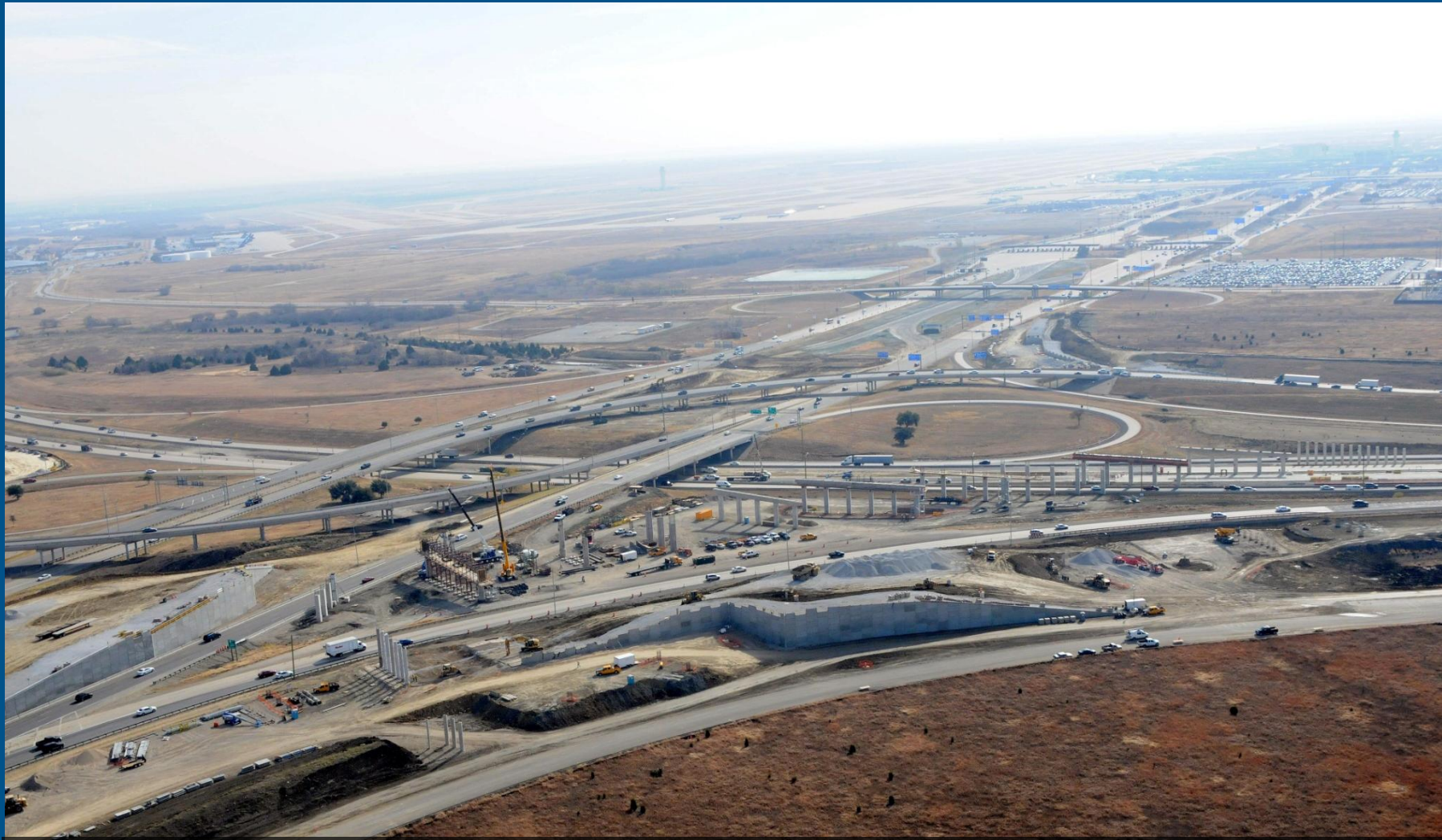
December 2010: Eastbound SH 114 to northbound SH 121 bridge