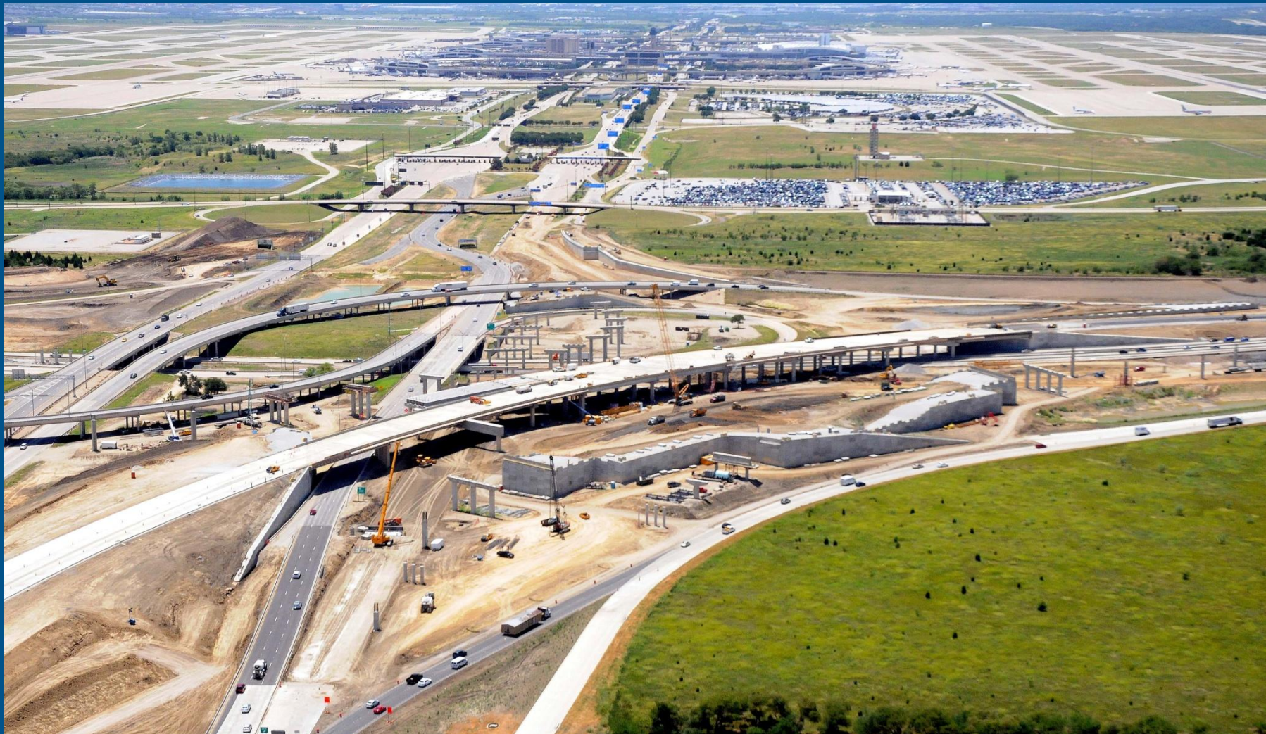
July 2011: Eastbound SH 114 to northbound SH 121 bridge