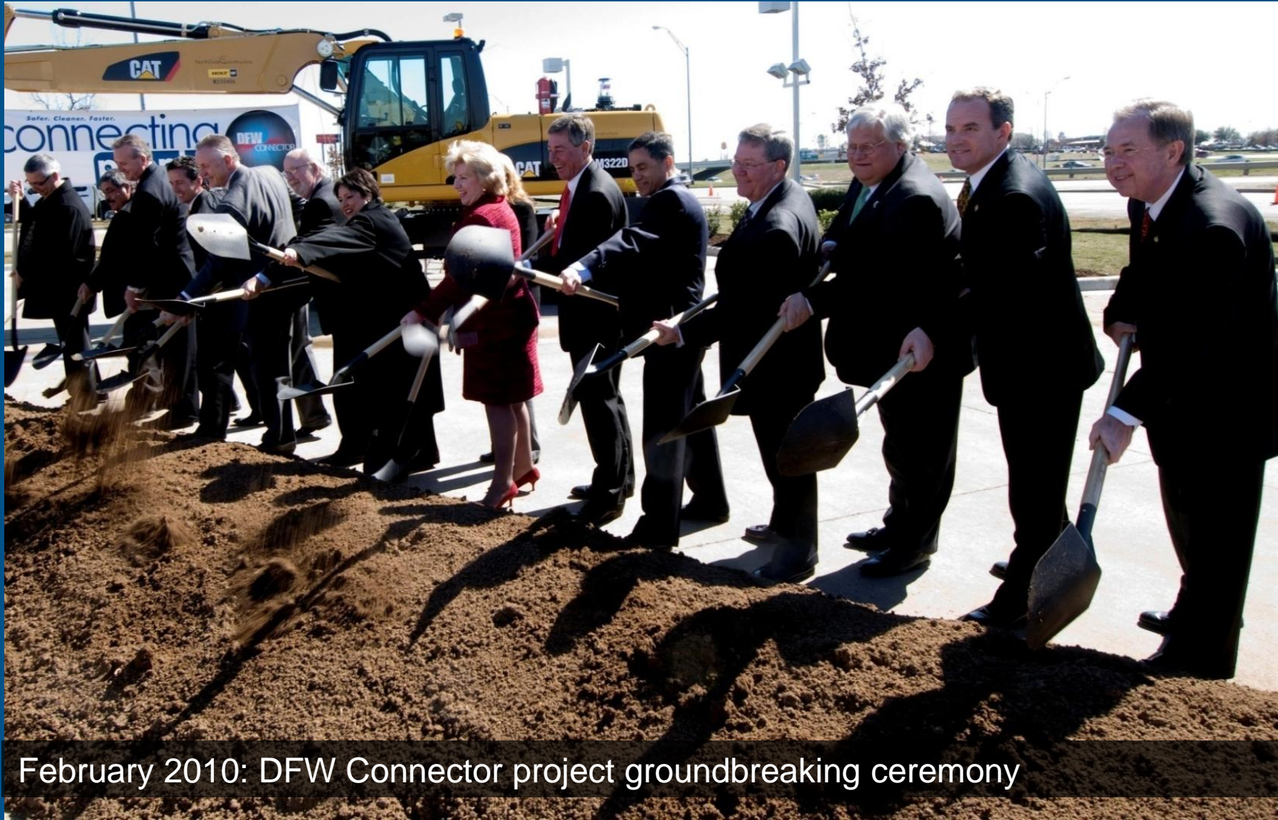
February 2010: DFW Connector project groundbreaking ceremony