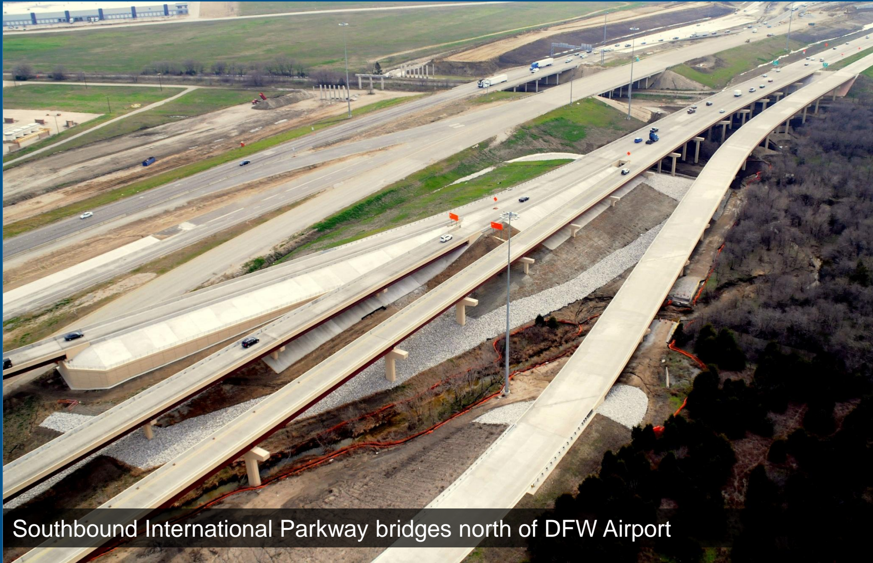
Southbound International Parkway bridges north of DFW Airport