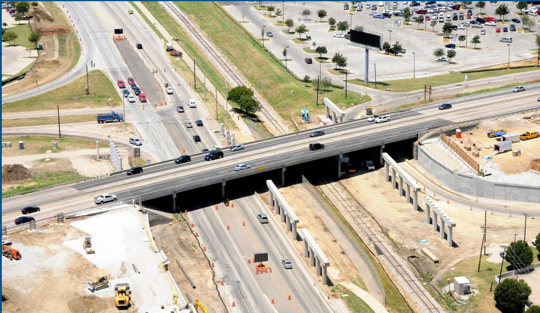
July 2011: SH 26 bridges