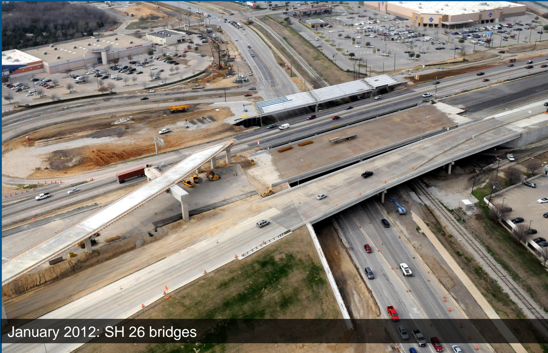
January 2012: SH 26 bridges