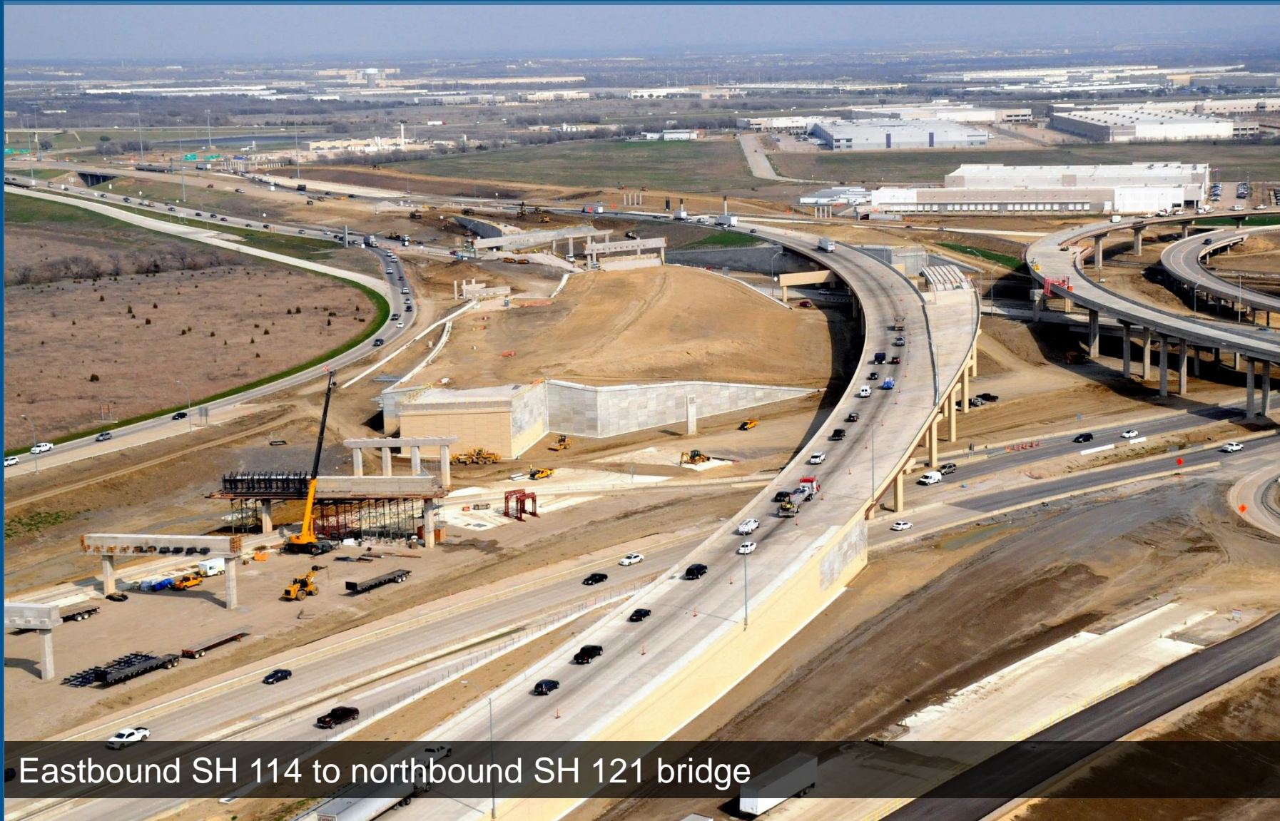
Eastbound SH 114 to northbound SH 121 bridge