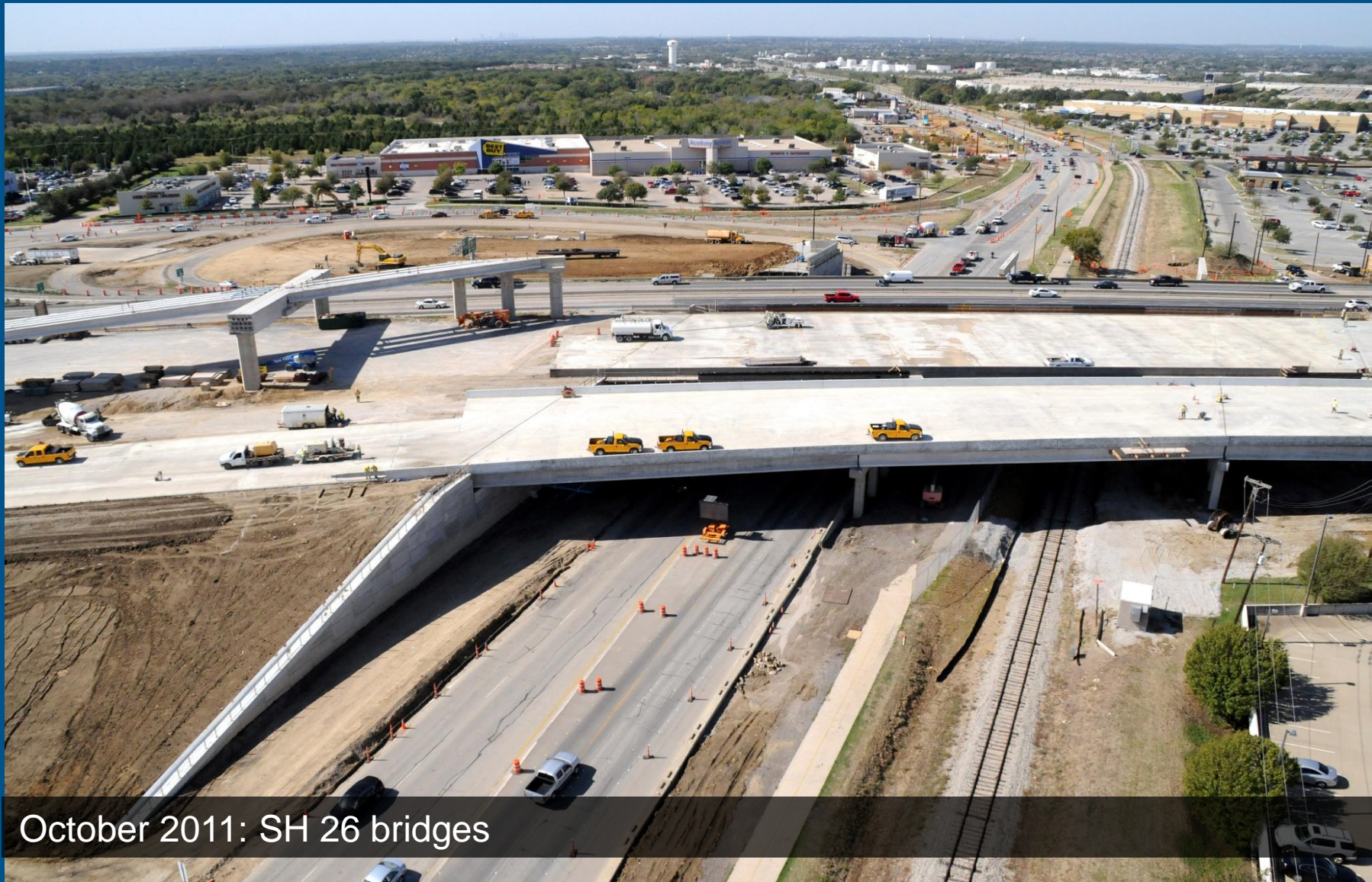
October 2011: SH 26 bridges