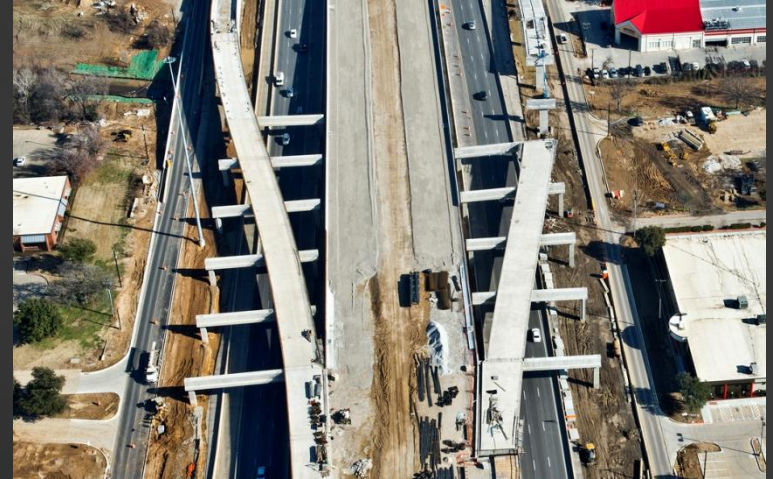
New TEXpress ramps east of Westpark