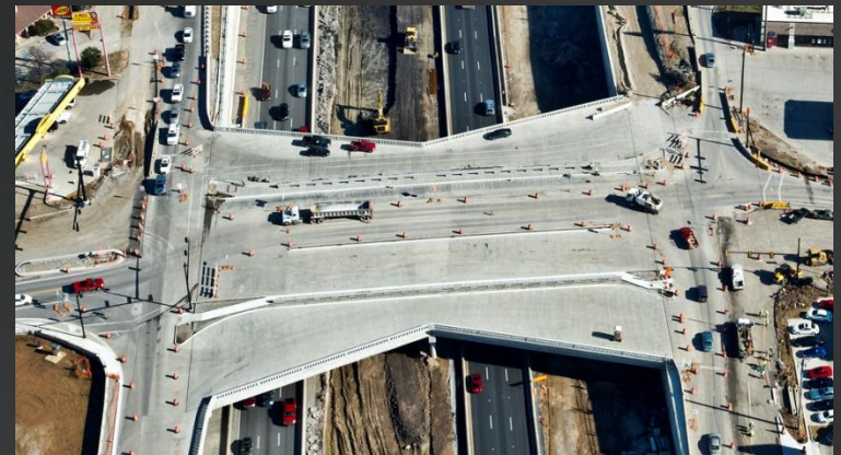
New Brown Trail bridge