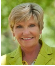
Betsy Price Mayor, City of Fort Worth

Betsy Price, a Fort Worth native, was elected as the 44th Mayor of the City of Fort Worth June 18, 2011.