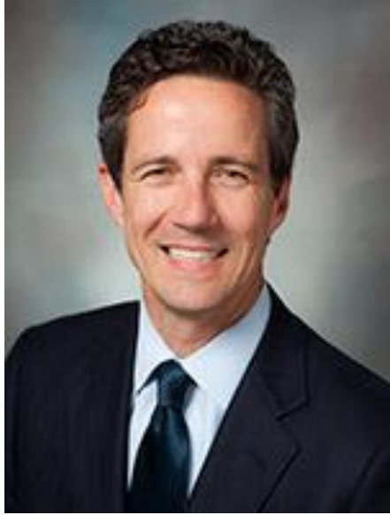
Senator Hancock Co-Sponsor