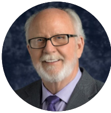
Commissioner Gary Fickes Tarrant County • Precinct 3