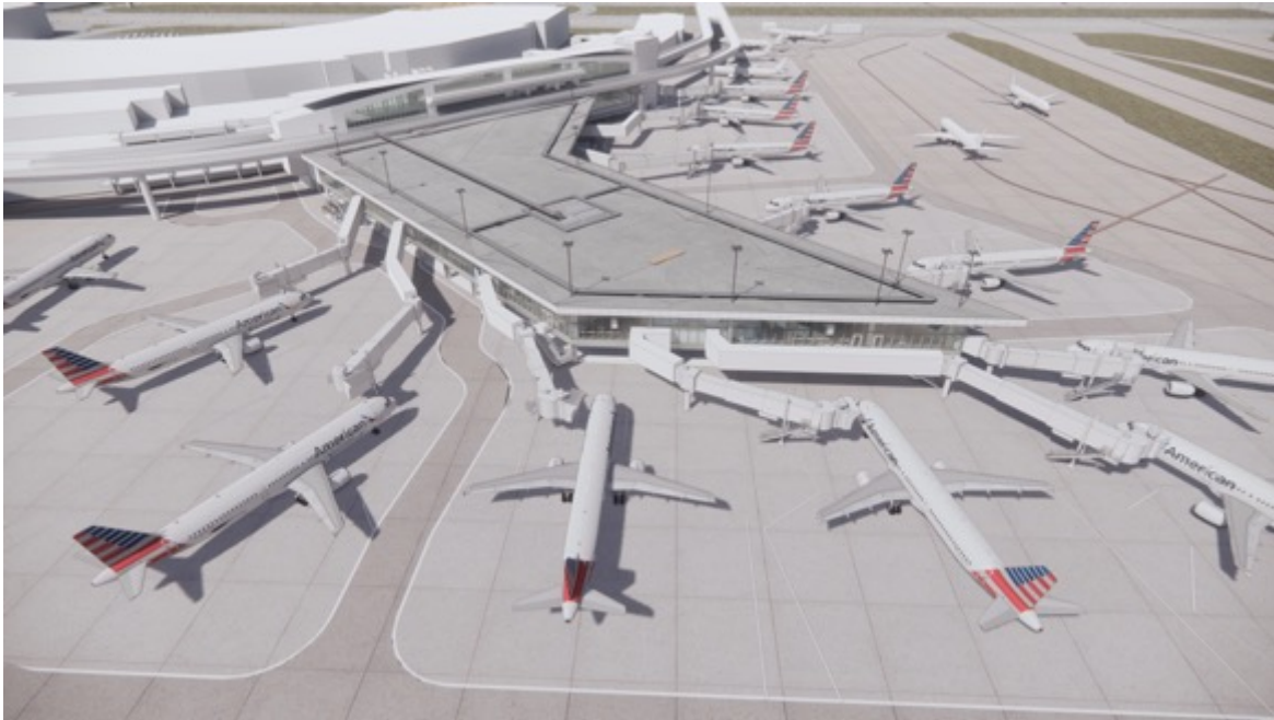
Terminal A Pier